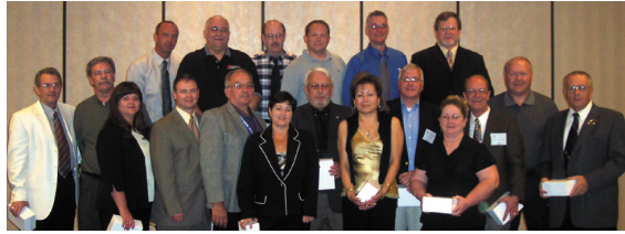
▲ NAPFTDS recognizes dedication of State Membership Captains.