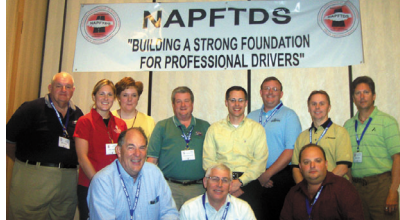
◀ We appreciate our generous sponsors!