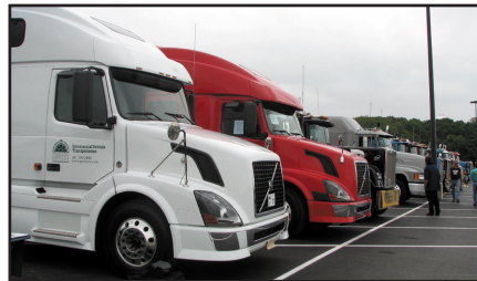
Pictured is one of HCC's three new 2006 Volvos purchased with the DOL grant. HCC received a $1.65 million grant from the DOL to address the shortage of truck drivers in the quad-state region.

YRC Enterprise Services (Yellow Roadway), one of the largest transportation service providers in the world;