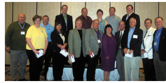
◀ 2007 Board of Directors